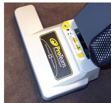
VACUUM (IF DRY)