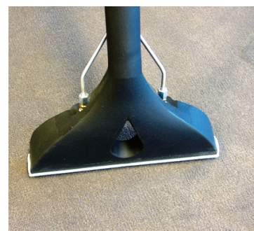
EXTRACT (IF NECESSARY)